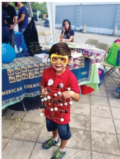
A child builds a molecular model at the Puerto Rico Section's Festival de Química in San Juan.