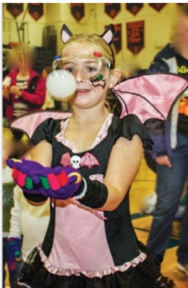
A girl plays with dry ice during the Syracuse Section's Spooktacular event at East Syracuse-Minoa High School.