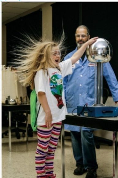
A girl gets a hair-raising experience during the Northeast Tennessee Section's event at Eastman Chemical.