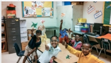
In the Middle Georgia Section, children at Ridge Road Primary School learn about wind energy by making pinwheels.

industries, all of the nonprofits, and all of the community partners for providing assistance and venues and partnership," he says.